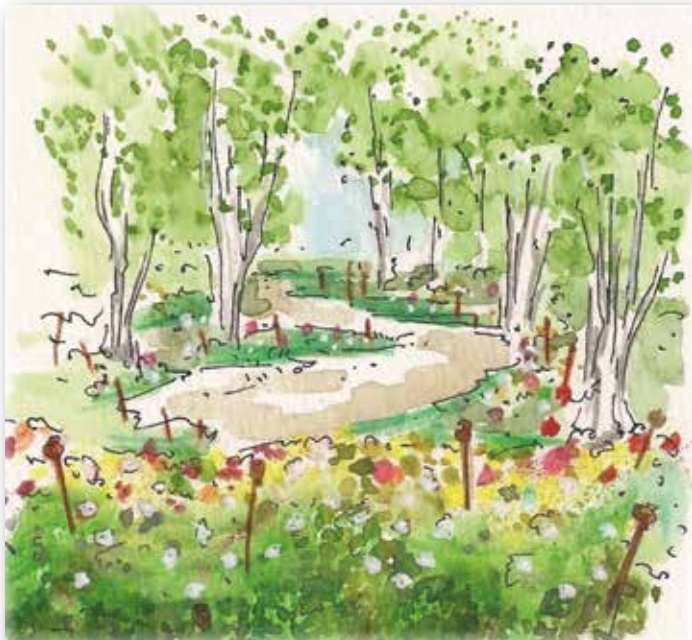
Artist's impression of the garden south side