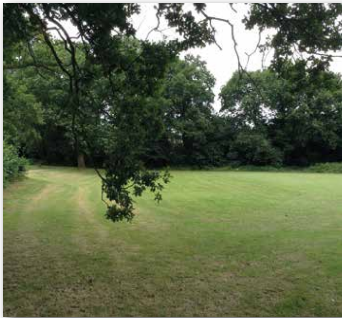
Details of garden south side as it is today