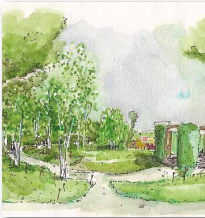
Artist's view from play area